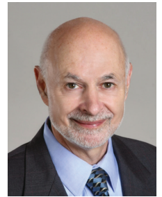
Oneonta Mayor Gary Herzig