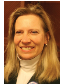
Cooperstown Mayor Ellen Tillapaugh